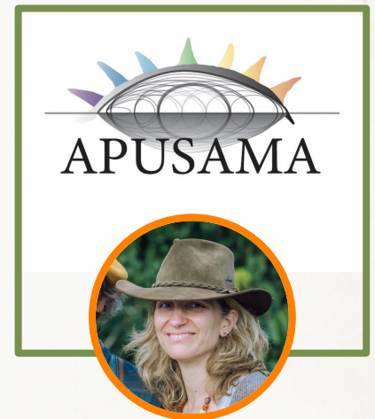
APUSAMA Embodied spiral method

H1: Current system, showing signs of strain